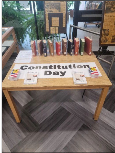
Hallie Q. Brown Memorial Library Constitution Day display