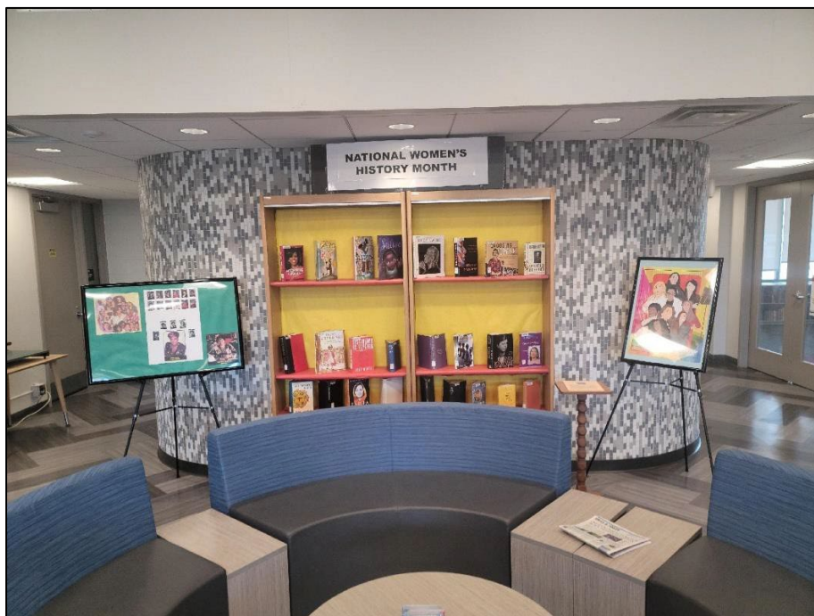
National Women's History Month display