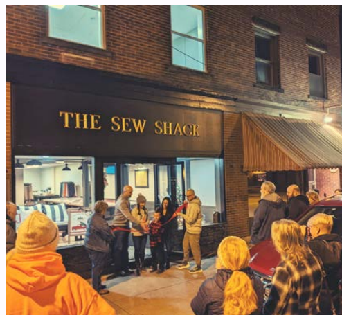
New business opening in Beach City

Resilient Communities is CED's most recent program offering. Resilient Communities is a year-long series of monthly workshops that integrate community planning practices. Participating communities (urban neighborhoods and rural towns) will assess their assets and needs, prioritize their best growth opportunities, identify potential resource partners, and implement community improvement projects.